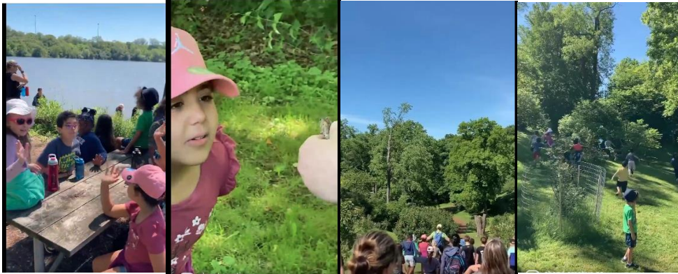
Grade 1 & 2 Field trip to The Royal Botanical Gardens and Arboretum in Hamilton