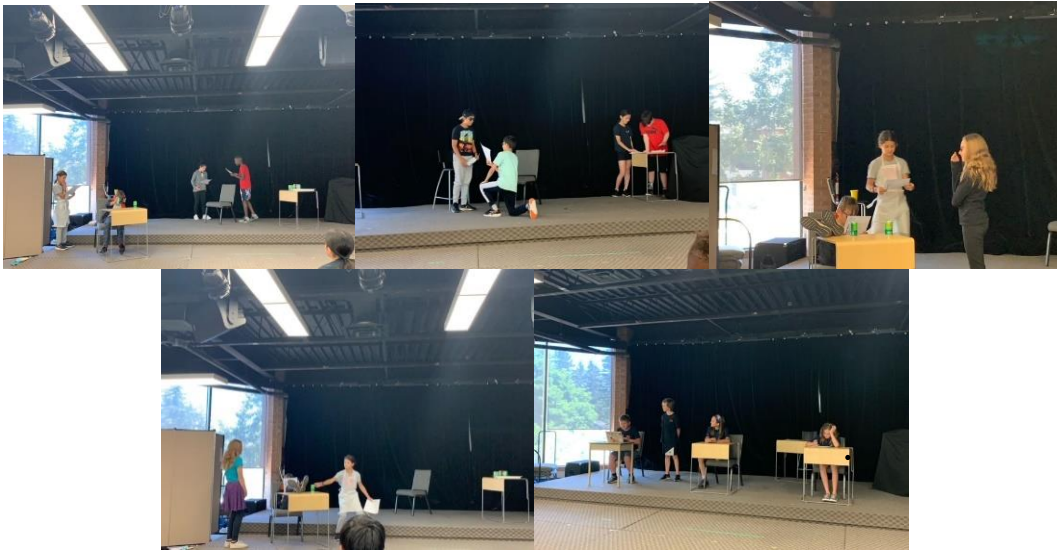
Grade 5 students acting out the skits they wrote based on parables

Academic Excellence and Godly Instruction